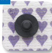
Softrace® Small RTL