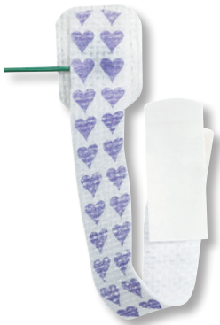
Softrace® Limb Band