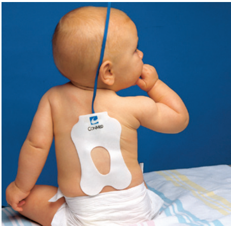
Infant ECG Backpad