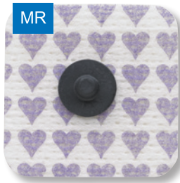
Softrace® Large RTL