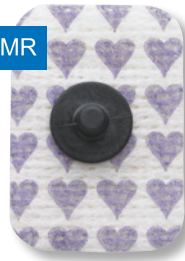
Softrace® Medium RTL